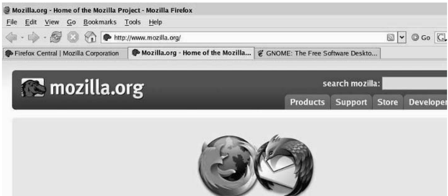
Fig. 1: Tabbed Browsing in Firefox

Firefox has been highly successful, earning praise for its innovative features as well as robustness [10, 22].